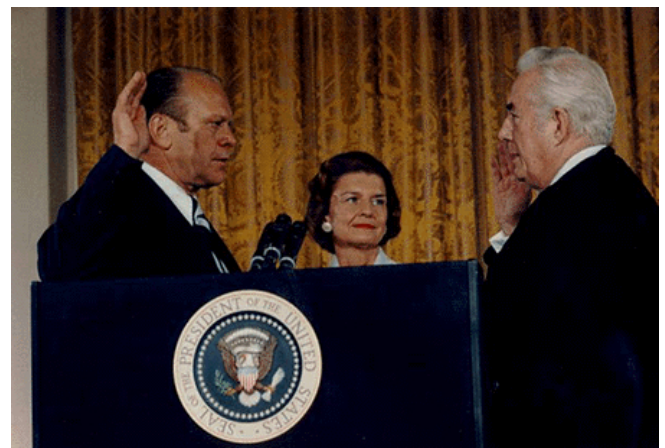
The late President Gerald Ford is sworn in by the Supreme Court Justice as his wife, Betty, looks on.