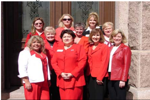
BLRWW Delegation on steps of Texas Capitol.