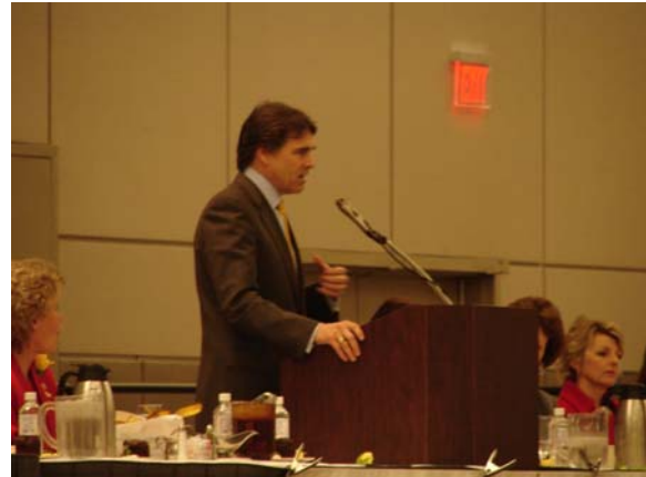
Governor Perry speaks at Legislative Day luncheon in Austin.