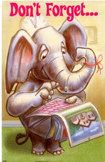
Cartoon courtesy of Dottie Worthington.

ATTENTION! IMPORTANT! ATTENTION! IMPORTANT