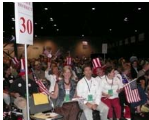
Flags waive as District 30 is well represented at the 2008 State Convention