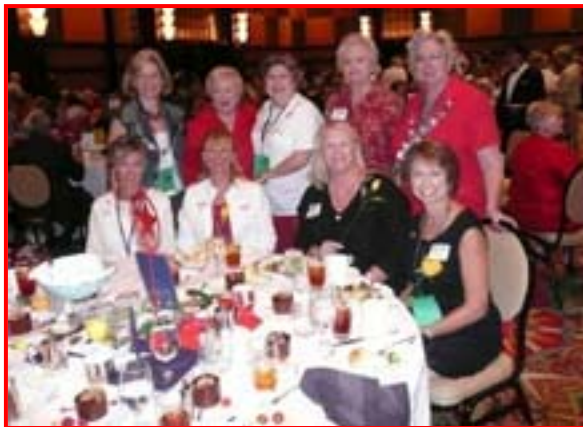
Scenes from 2008 State Convention