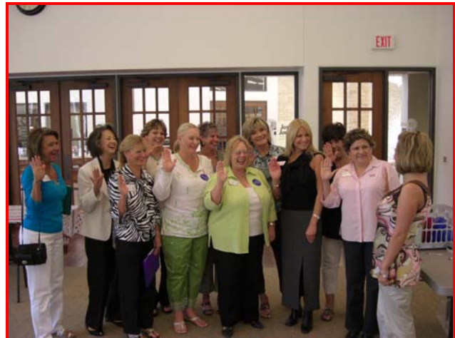
June meeting of BLRWW