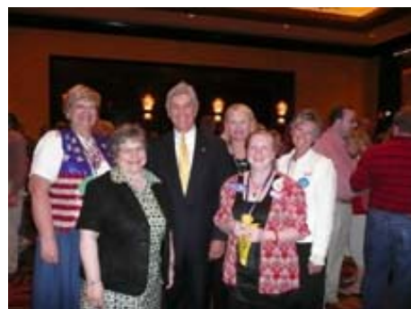
Delegates visit with Roger Williams at Senator Cornyn’s reception during 2008 State Convention