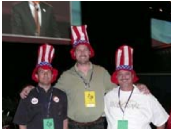
Patriotic delegates at the 2008 State Convention

Justice Scalia said nothing in the Thursday June 26, 2008, ruling should "cast doubt on long-standing prohibitions on the possession of firearms by felons or the mentally ill, or laws forbidding the carrying of firearms in sensitive places such as schools and government builds. The vote went as follows. Chief Justice John Roberts and Justices Samuel Alito, Anthony Kennedy, Antonin Scalia and Clarence Thomas supported the decision. The dissenters were Justices Stephen Breyer, John Paul Stevens, Ruth Bader Ginsburg and David Souter. This should surprise none of us that have followed the supreme court's rulings. It is another example of why this election is so important. Justices Beyer and Ginsburg are rumored to want to retire, but are waiting until after the election in hopes that liberal judges can take their place and continue to undermine the constitutions meaning.