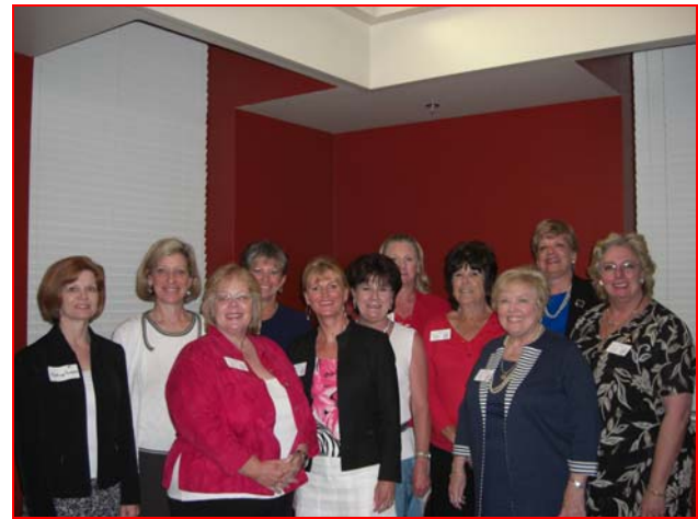
BLRWW attendees at Victory 2008 in Arlington

hours during the day we would greatly appreciate it. Our year is half over and we still have a lot to do and a lot of great programs and fundraisers on the way. Our membership is growing and I encourage each of you to start bringing a guest to the meetings and encouraging them that this is a wonderful and energetic group of women to know and belong. Our meeting will be on Thursday, June 19 th at the Doss Heritage Museum. Please make reservations and hope to see you there. Have a great month of June.